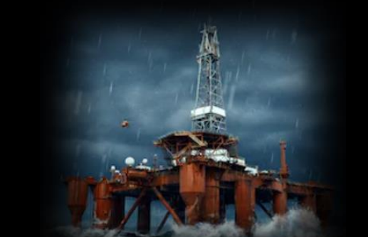
Offshore and Onshore Drilling and Exploration