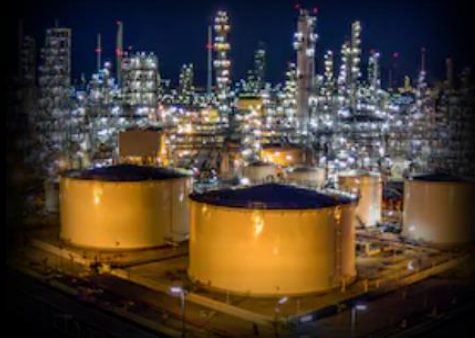
Onshore Oil & Gas