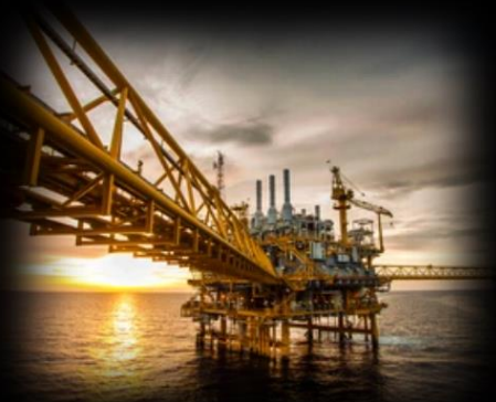
Offshore Oil & Gas

HRM are a well-established, highly experienced, specialist HSEQ and Technical Safety engineering consultancy delivering a wide range of services and cost-effective solutions for its Clients in the following industries: