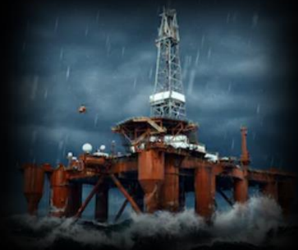
Offshore Oil & Gas

HRM are a well-established, highly experienced, specialist HSEQ and Technical Safety engineering consultancy delivering a wide range of services and cost-effective solutions for its Clients in the following industries: