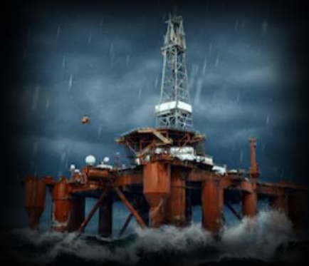
Offshore Oil & Gas

HRM are a well-established, highly experienced, specialist HSEQ and Technical Safety engineering consultancy delivering a wide range of services and cost-effective solutions for its Clients in the following industries: